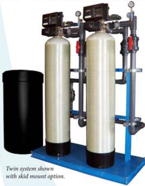
Twin system shown with skid mount option.