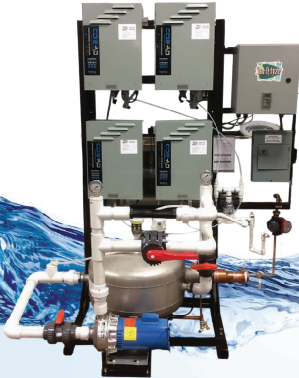
San-O 3 -tyzer Complete™ and San-O 3 -tyzer Lite™